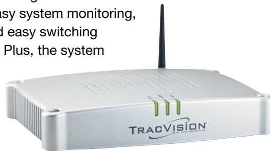
The TracVision TV-Hub is a streamlined IP-enabled belowdecks unit that makes the TV8 extremely easy to use

Designed for worldwide use and ease of operation, the TracVision TV8 has automatic skew control and integrated GPS for the fastest satellite acquisition and unmatched tracking. The TV-Hub enables trouble-free setup, easy system monitoring, multi-satellite configuring, and easy switching between satellite TV services. Plus, the system supports automatic satellite switching from the remote control and multiple TVs and receivers so everyone onboard can enjoy the TV programs they want.