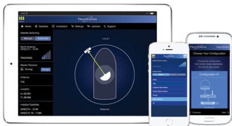
TV-Hub user interface provides system control from any mobile device or computer.