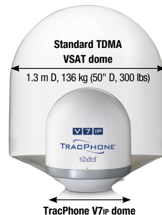
66.3 cm D, 26.1 kg (26.1" D, 57.6 lbs)

Streamlined belowdecks unit includes: IP-enabled antenna control unit, built-in CommBox Ship/Shore Network Manager, ArcLight spread spectrum modem, Voice over IP adapter, and built-in Wi-Fi and Ethernet switch.