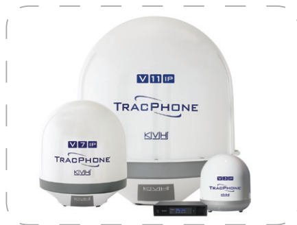
This option is for use only as a complementary system to mini-VSAT Broadband products.